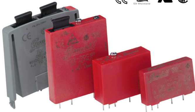
70L-ODC5R 70G-ODCR/OACRLY 70-ODCR/OACRLY 70M-ODCR